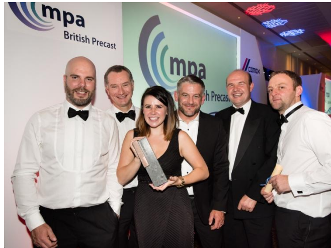
Picture: Winner of the 2016 Sustainability Award - Marshalls Plc

Sustainability: This award recognises the good work our members have carried out in improving the sustainability of their business. The award is open to Full and Associate members.