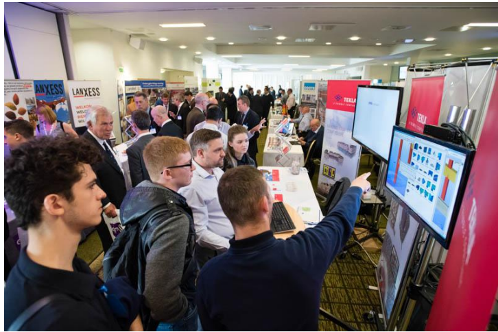
Picture taken at PRECAST2015 Exhibition

AGM & Annual Conference: In May each year British Precast holds its AGM and Annual Conference and Exhibition 'PRECAST'. The day provides members with a review of progress during the last 12 months and a briefing on the year ahead. The conference is a forum for speakers from both the UK and overseas to discuss innovations in new technology and precast techniques, and gives opportunities for Associate members to showcase their products with a free exhibition space and a platform for presentations. There are opportunities for both full and associate members to participate in our successful Speed Networking sessions during the event. This event offers a superb networking opportunity and is open to all members. Sponsorship opportunities are available.